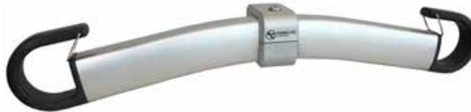
Hanger bar for portable lifts

*hanger bars must be ordered with every lift, including portable models Roomer S and Altair