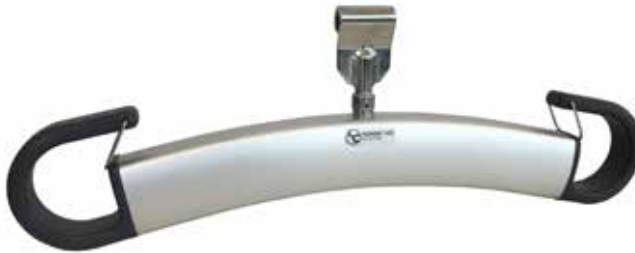
Hanger bar for HeliQ lifts

We are pleased to present two new 2-point fixed hanger bars that are lightweight, yet extremely durable. Available in three sizes, these new hanger bars feature a sleek, modern design and can be easily affixed to all our lifts. Made of aluminum, the aesthetic design not only compliments any room, but assures that patients are lifted safely and securely.